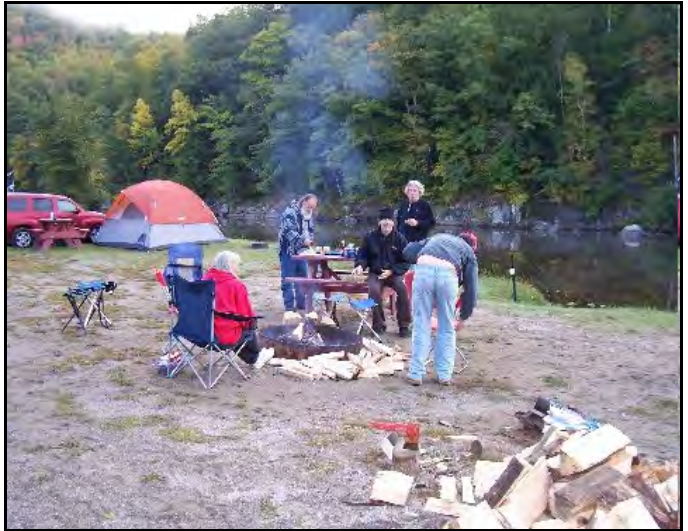
Early morning campfire