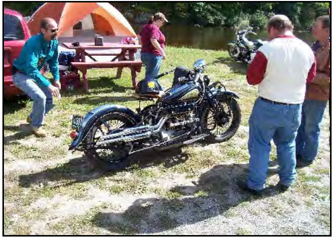
1937 Indian 4 police Bike