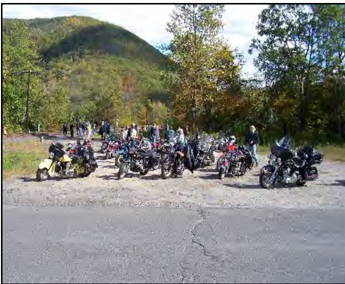
Group stop @ the Hossic Tunnel