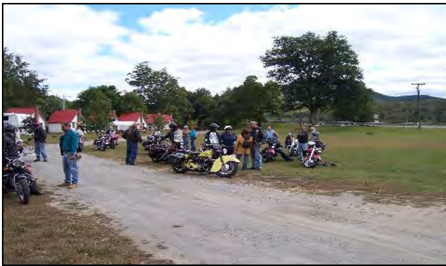
Gathering for the afternoon run