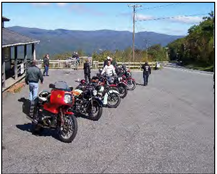
Rte 2 overlook above hairpin turn Florida, MA