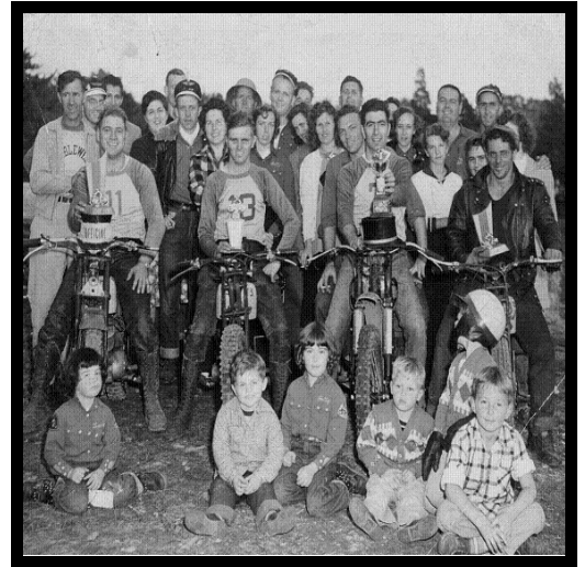
1950's Tumbleweed MC Race Team

Today we are registered with the American Motorcycle Association as a Historical Motorcycle Club. We believe in the old ways of life and friendship, we ride and love old motorcycles. We help down bikers and their families. Most of our members are also AMCA members too. We are here to stay, with members in MA, ME, RI, and VA, and we are growing strong. We all believe in friendship, helping others and riding old motorcycles as a way of life.