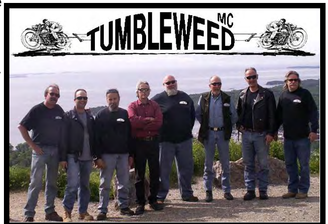
AMCA Maine Road Run 2009

You can see more on our web site tumbleweedmc.com . We are always looking for new members. So if you ride old motorcycles and like the old ways, e-mail us at tumbleweedmc@comcast.net